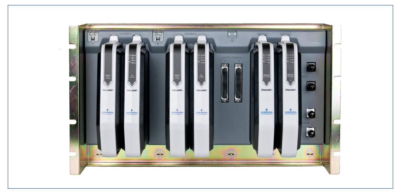
The S-Series DeltaV Controller Interface for PROVOX I/O.