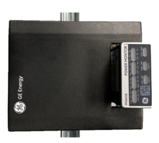
JPDG Dual Control & Wetting Power, with Cover