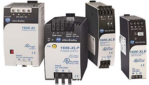
Representative Photo Only (actual product may vary based on configuration sections)

Description: Redundancy Module, Vin 1 -.9Vin, 480 W, 10-60V DC Input Voltage